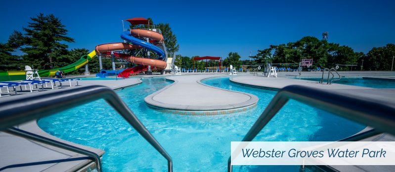
Webster Groves Water Park