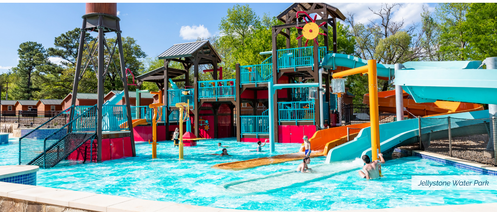
Jellystone Water Park