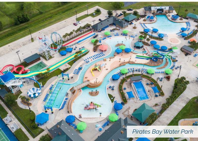
Pirates Bay Water Park