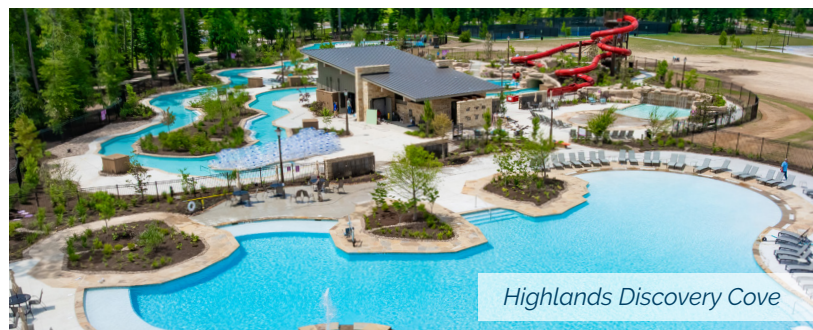
Highlands Discovery Cove