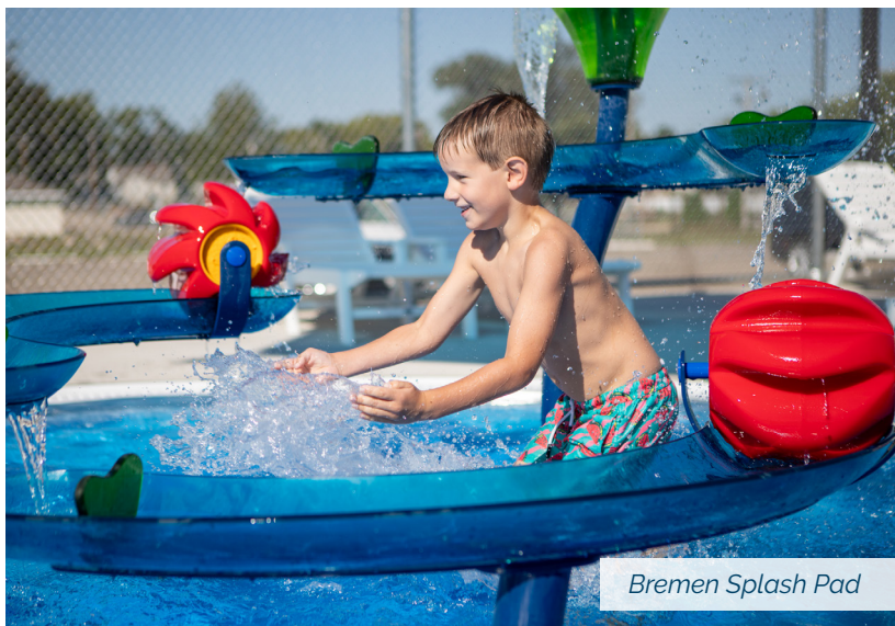
Bremen Splash Pad