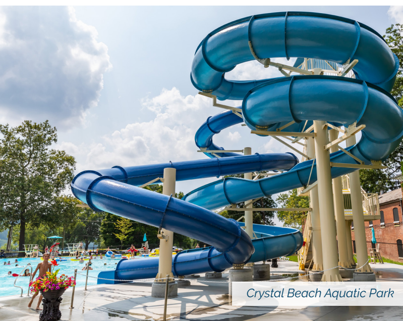
Crystal Beach Aquatic Park