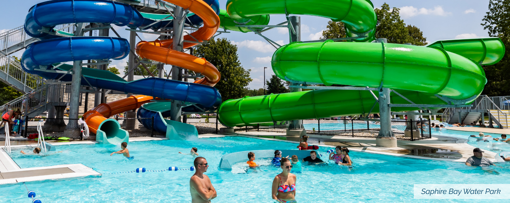
Saphire Bay Water Park