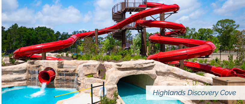
Highlands Discovery Cove