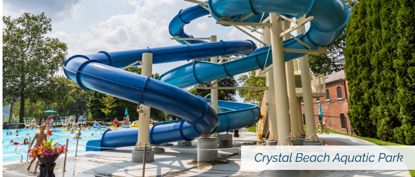
Crystal Beach Aquatic Park