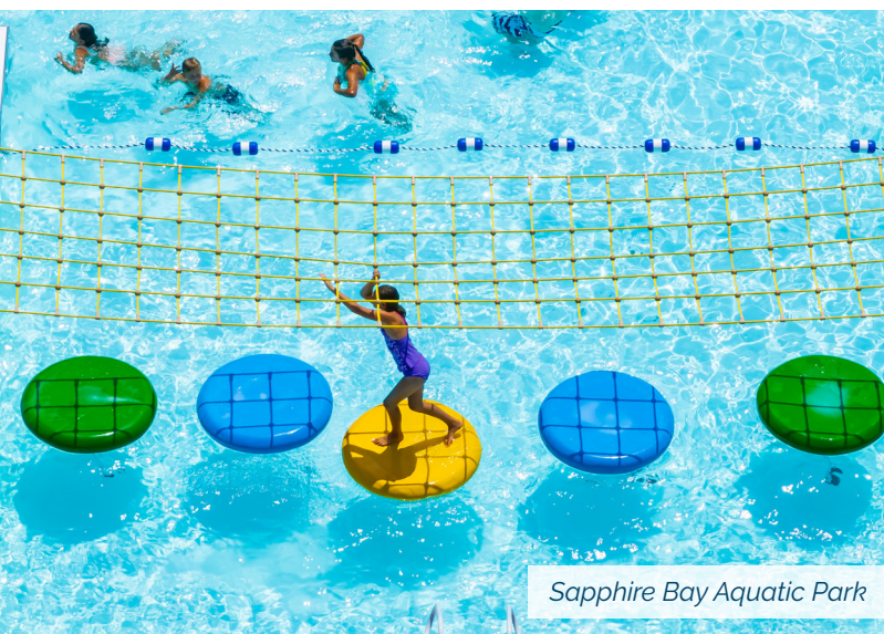
Sapphire Bay Aquatic Park