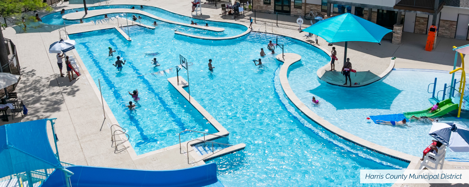
Harris County Municipal District