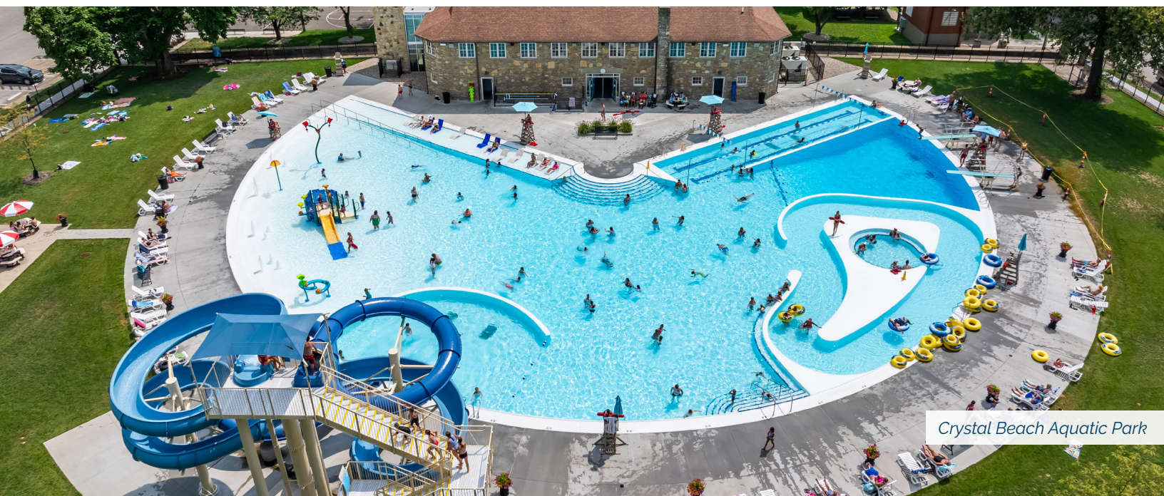
Crystal Beach Aquatic Park