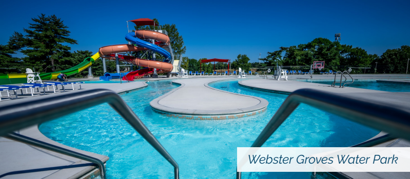
Webster Groves Water Park