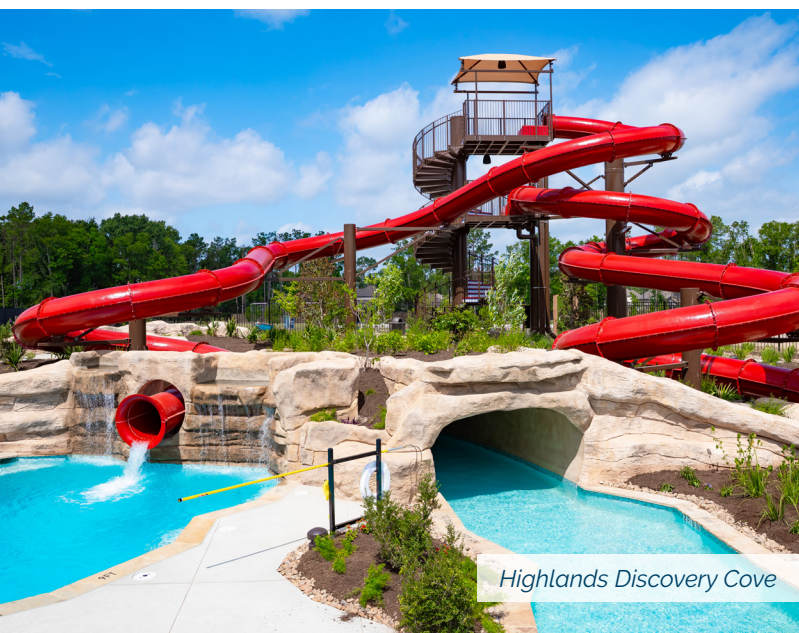
Highlands Discovery Cove