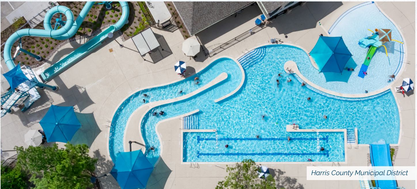
Harris County Municipal District

We understand the unique requirements of public procurement, budgeting, permitting, and stakeholder collaboration that shape both development and long-term sustainability. And our BuyBoard membership helps streamline the bidding process, saving you time and money during key planning stages. From city water parks to neighborhood splash pads, we deliver projects on time, on budget, and in full compliance