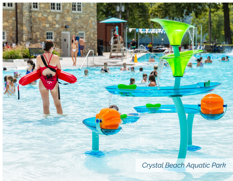
Crystal Beach Aquatic Park