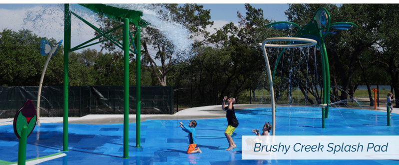
Brushy Creek Splash Pad