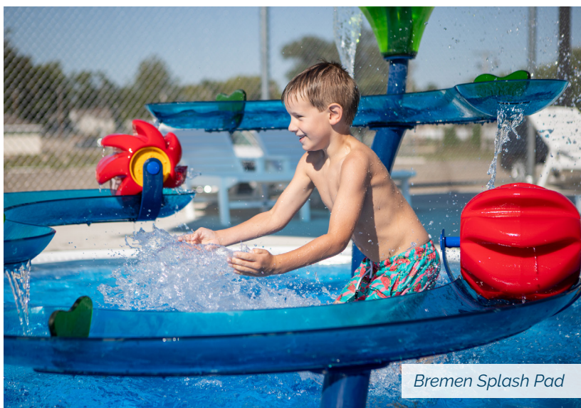
Bremen Splash Pad