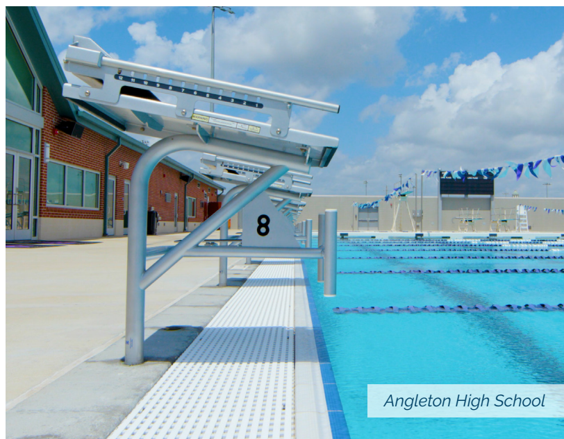
Angleton High School