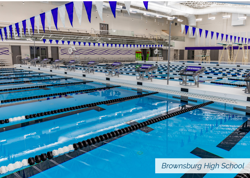
Brownsburg High School