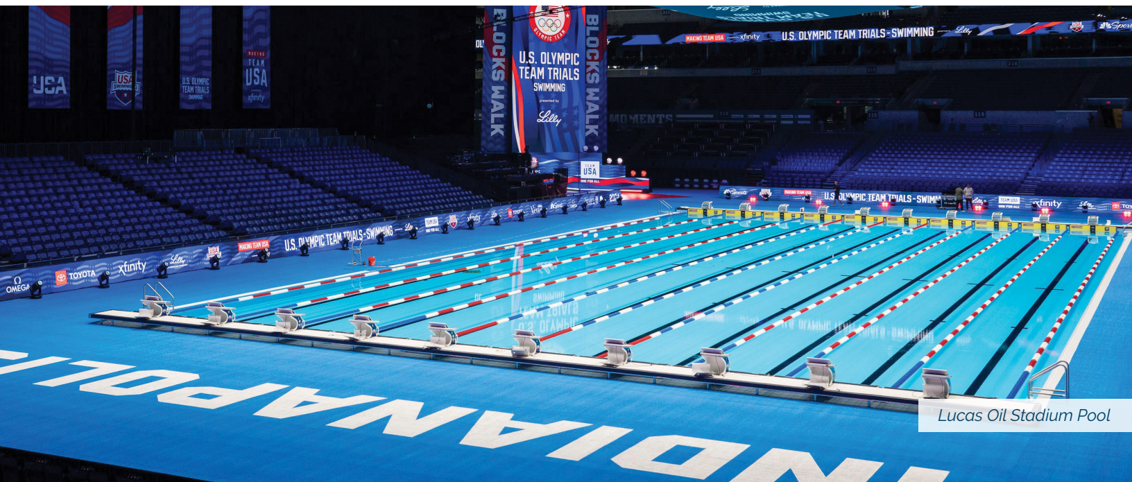
Lucas Oil Stadium Pool