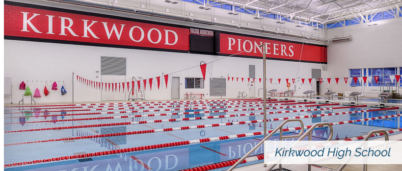
Kirkwood High School