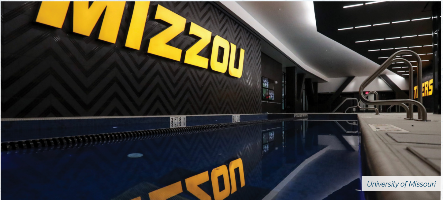
University of Missouri

For over six decades, Landmark Aquatic has partnered with K-12 schools, colleges, and universities to design, build, and maintain high-performing aquatic facilities. Whether it's new construction, renovation, or ongoing maintenance, we help you protect your investment, minimize downtime, and keep every swim session, class, and competition running smoothly. We handle the systems behind the scenes—plumbing, filters, equipment, water care—so you can focus on what truly matters: your students, your programs, and their success in the water.