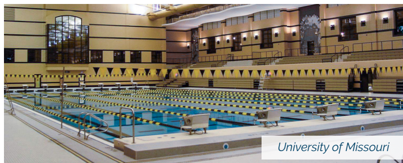
University of Missouri