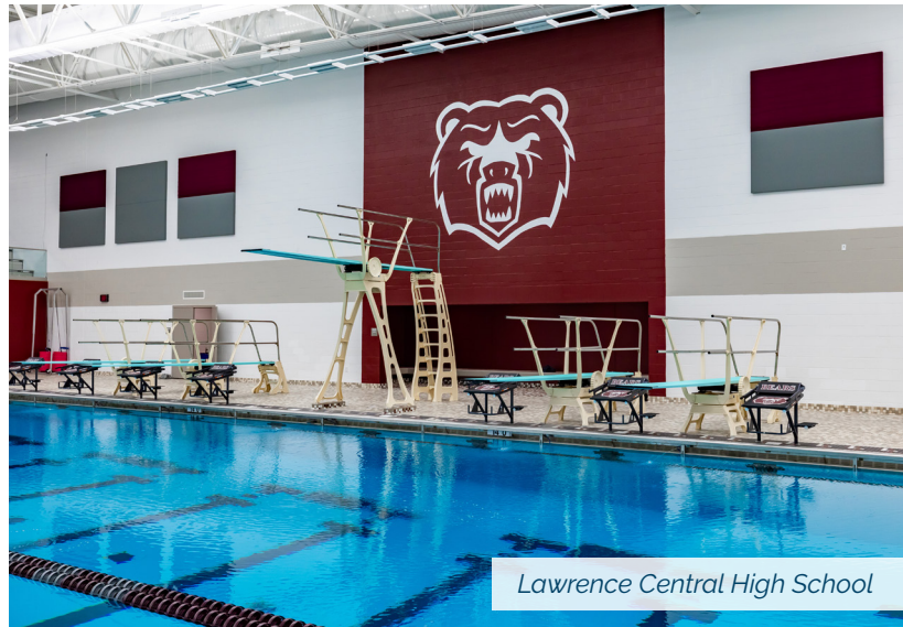
Lawrence Central High School