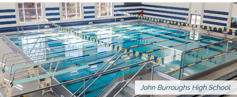
John Burroughs High School