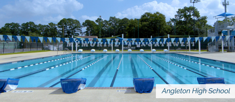
Angleton High School