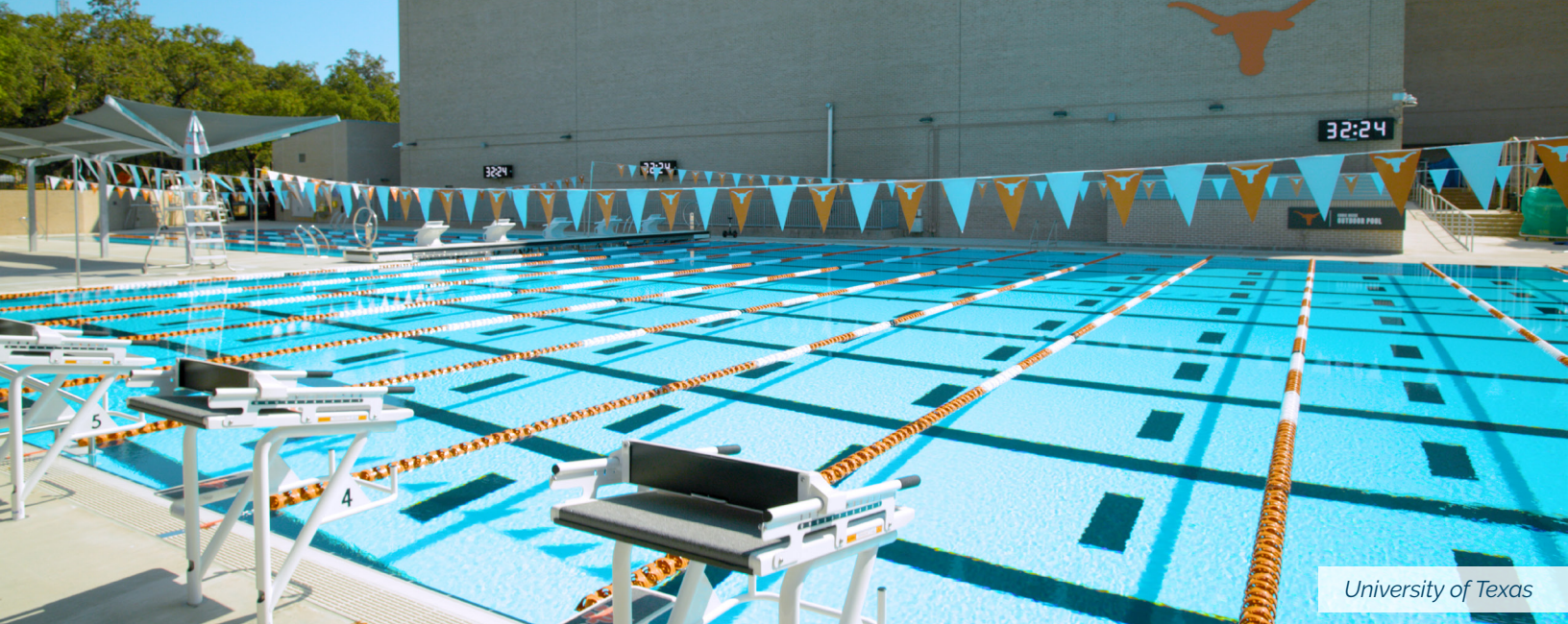
University of Texas