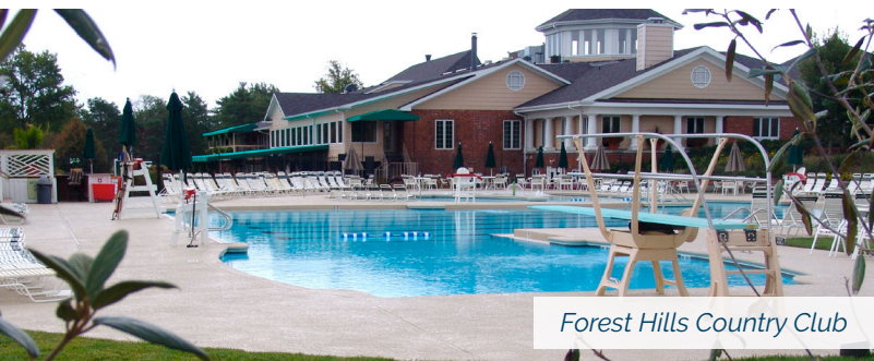
Forest Hills Country Club