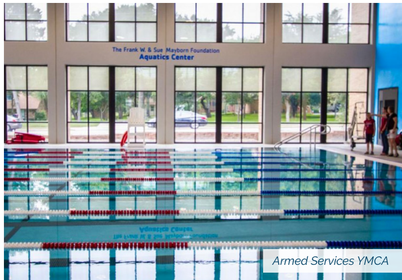
Armed Services YMCA