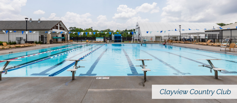
Clayview Country Club