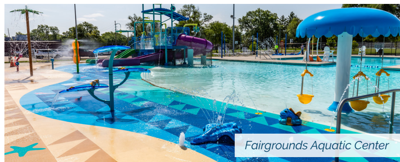
Fairgrounds Aquatic Center