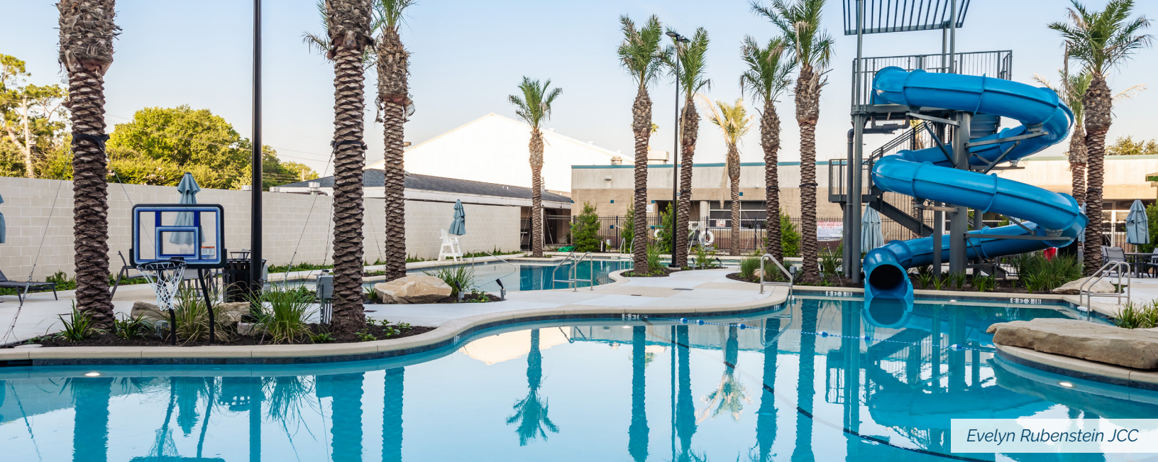
Evelyn Rubenstein JCC